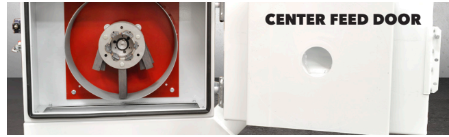
CENTER FEED DOOR

Feed inlets are 4" (10.2 cm) or 6" (15.2 cm) diameter.